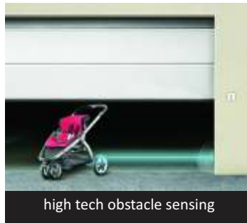
high tech obstacle sensing