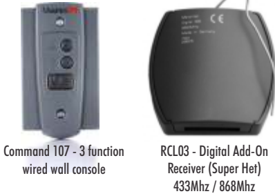
Command 107 - 3 function wired wall console